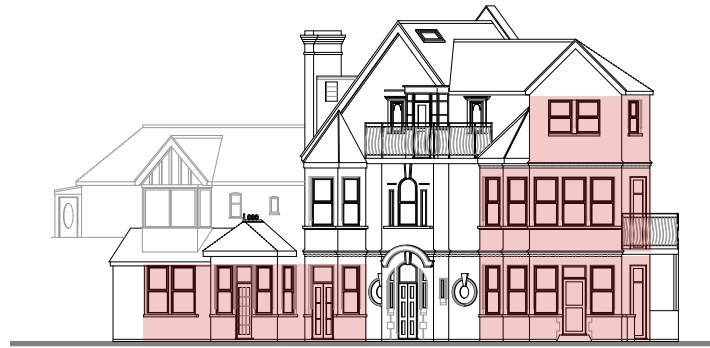
South West East